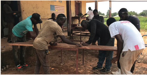
Above: Students finish building benches for a local church.

The welding program, now in its sixth year, has evolved from a basic welding class to a highly-productive, hands-on course that gives its students plenty of real-world experience while also generating significant revenue for the WAVS School. In 2017, the students and staff took on 11 major projects for clients in the community and generated more than $4,000 in profit for the WAVS School.