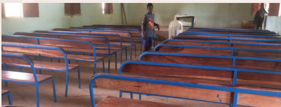
Below: The completed benches in the church.