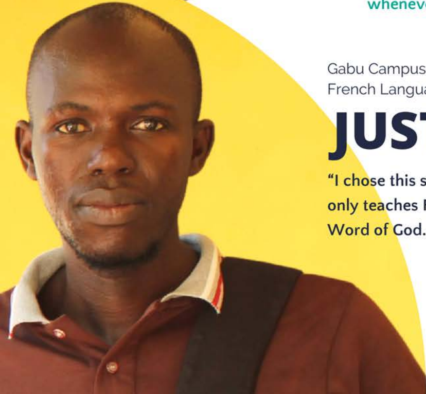
Gabu Campus French Language Student

“I am studying to be a doctor. I want to be a doctor who knows technology very well so that whenever I need to research something, I can.”