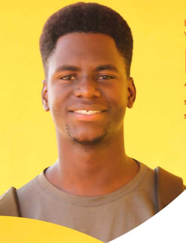
Bissau Campus Welding Student